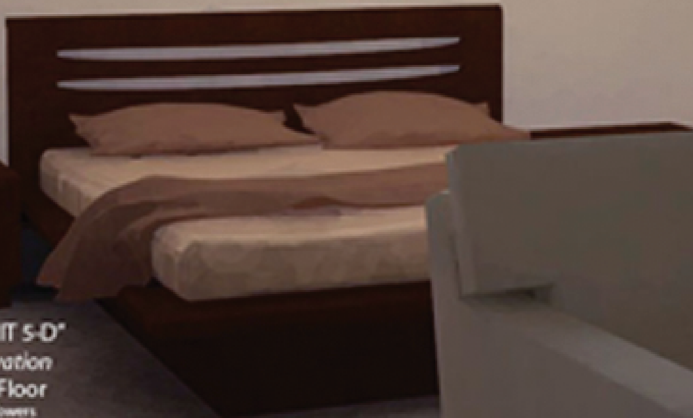
"TUSCANY UNIT 5-D" Interior Renovation Unit 5-D 5th Floor Tuscany Makati Towers Ayala Ave. Makati City